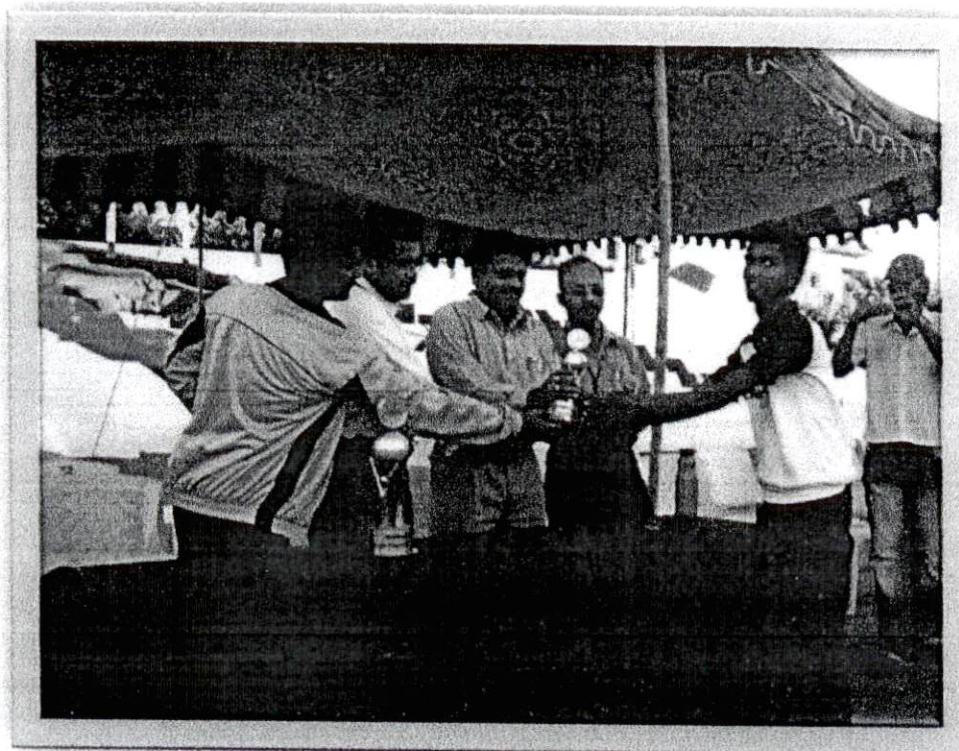
Closing session of Aditya Premier League

PRINCIPAL Aditya Engineering College SURABPALEM